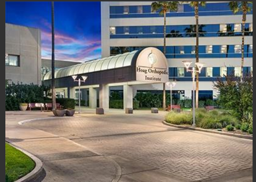
Hoag Orthopedic Institute operates a total of 6 locations across California. Pictured above is the hospital location in Irvine.

Hoag Orthopedic Institute (HOI), a specialty hospital located in Orange County, CA, is focused on delivering the highest quality orthopedic and spine care. In order to execute on this strategic priority, HOI leverages the most up-to-date network data to partner with top-performing surgeons in the Southern California market. The HOI team deployed Clarify's network insights, which provided them with outcome scoring on facilities, physicians, and healthcare systems. With a clear view into provider performance, HOI was able to quickly and effectively review and recruit high-quality surgeons for partnership opportunities. HOI has partnered with Clarify on many healthcare-related solutions since 2017.